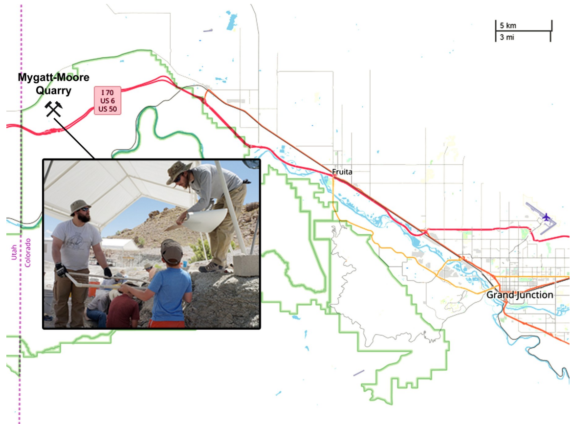
Fig 1. Map of western Colorado showing the location of the Mygatt-Moore Quarry (© OpenStreetMap contributors | https://www.openstreetmap.org/copyright ). Inset photo shows museum field crew and citizen scientists during a public excavation through the Museums of Western Colorado at the Mygatt-Moore Quarry in 2018. The individuals pictured here provided written informed consent (as outlined in PLoS consent form) to publish their image alongside the manuscript.

https://doi.org/10.1371/journal.pone.0233115.g001