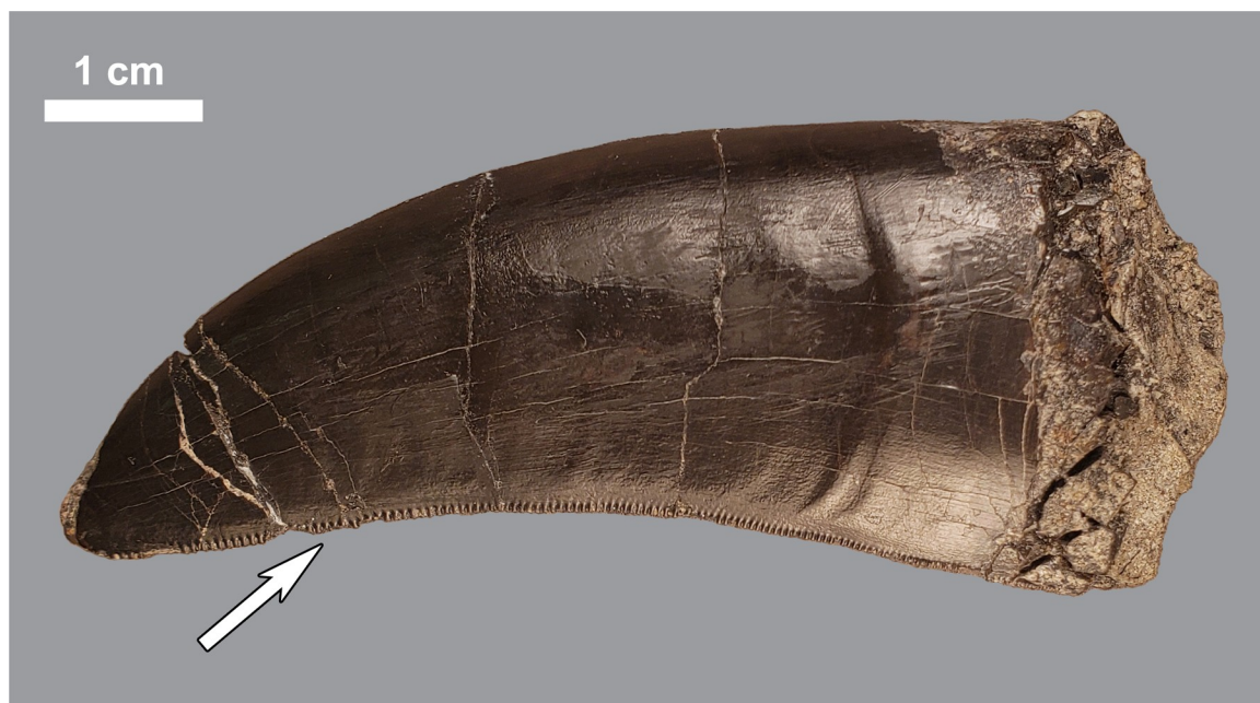
Fig 3. Shed lateral tooth of Allosaurus sp. (MWC 5011) found at the Mygatt-Moore Quarry, white arrow indicates the distal denticles. Mesial denticles are present on such teeth, but were not preserved in this specimen.

Frequencies of bite marks were surveyed from all positively identified skeletal elements (i.e., excluding bone fragments) in each taxonomic group were parsed according to associated nutrient values of a vertebrate carcass. Low economy elements preserve 52.876% of observed