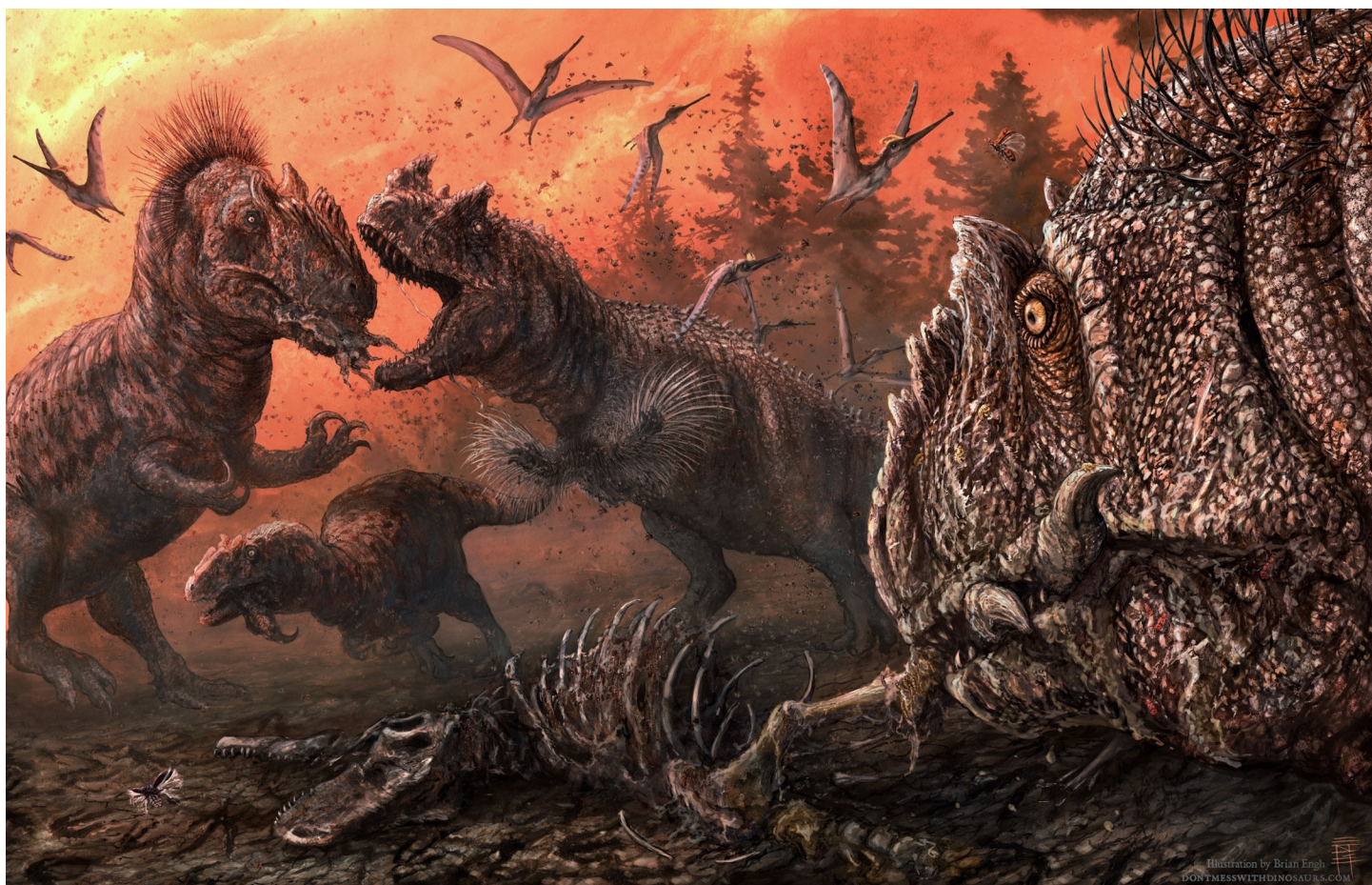
Fig 4. Dry season at the Mygatt-Moore Quarry showing Ceratosaurus and Allosaurus fighting over the desiccated carcass of another theropod. Illustration by Brian Engh (dontmesswithdinosaurs.com).

The Mygatt-Moore Quarry preserves an unusually highly tooth-marked assemblage from the Upper Jurassic Morrison Formation. Bite marks are consistent with a theropod trace maker, and striations place the traces within the range expected for the known large-bodied theropods from the site: Allosaurus and Ceratosaurus . The largest of these traces suggests an individual that is too large to be either taxon based on existing fossils, suggesting they were produced by an even larger taxon such as Saurophaganax or Torvosaurus . While the location of traces on herbivorous dinosaurs are consistent with predation or early access to remains, bite marks found on other theropod material, more specifically Allosaurus , are concentrated on lower-economy bones, suggesting that they represent incidences of scavenging. If the trace maker is Ceratosaurus , this study represents the first incidence of this taxon feeding on another large, contemporaneous theropod. If the trace maker is Allosaurus , this study represents the first time cannibalism has been reported in this taxon and its encompassing clade, Allosauroidae. If