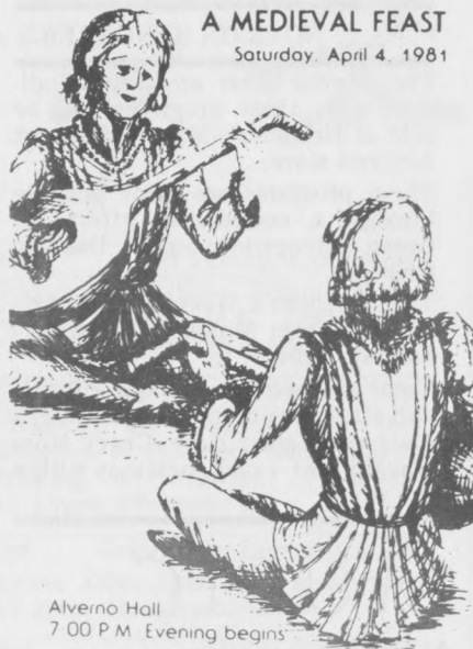
Alverno Hall 7:00 P.M. Evening begins Costume of the era preferred $9.00