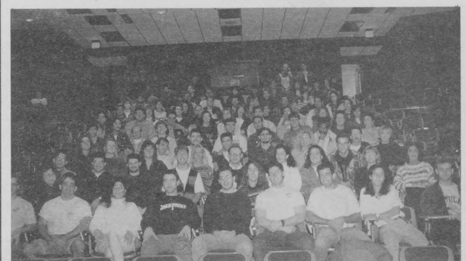
"Good Luck" on your affiliations!