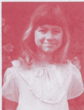
Easter 1988, Age 6