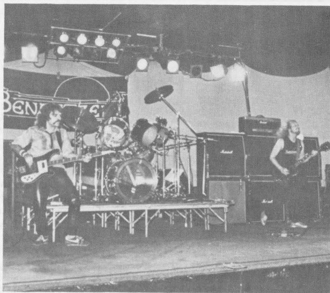
The band cranks out the music in a appearance at Uncle Sam's.